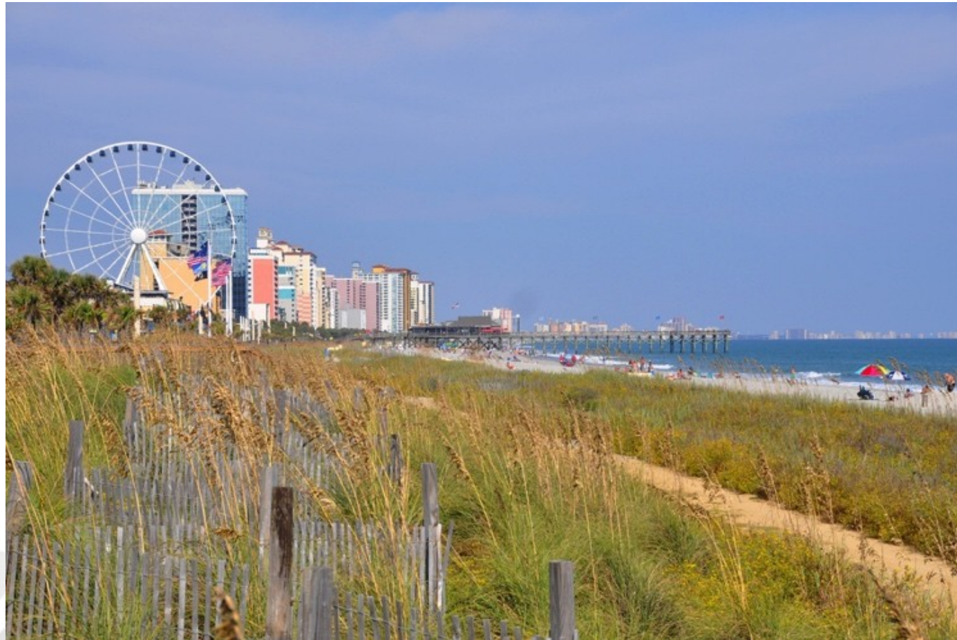
Myrtle Beach, SC